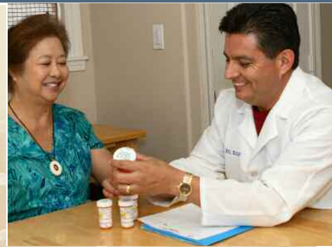
Medication review by an RN and a pharmacist.

With a personal medical alert service, help is available 24 hours a day at the push of a button.