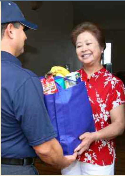
Home deliveries are available through Stay Healthy at Home SM .

“Stay Healthy at Home SM helped with arranging for having my laundry done and for grocery shopping at a reasonable price.”